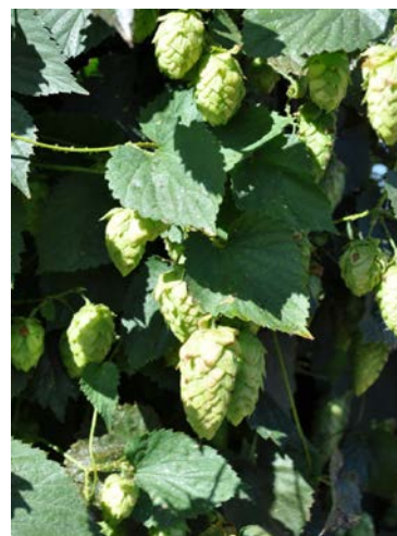
Topguard Fungicide Specialty Crops 14 fl. oz. – alternated with Quintec® fungicide 8 fl. oz.