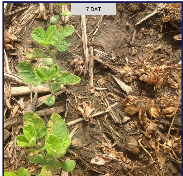
Anthem Herbicide @ 8 oz/a plus 32 oz/A of Durango® Herbicide

NIS – 1 qt/100 gal, or COC 1 gal/100 gal. When adjuvant loaded glyphosate herbicide or Liberty herbicide is used, additional adjuvant is not needed, but can be added if desired such as post-grass mixes. COC is recommended under dry or stressed weed conditions.