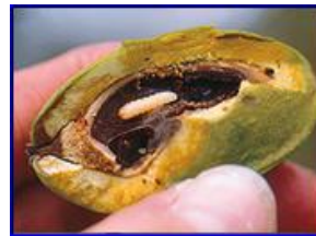
Hickory Shuckworm and damage