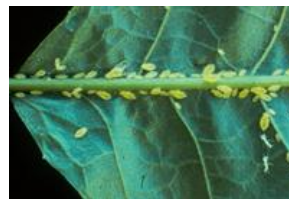
Yellow Pecan Aphid