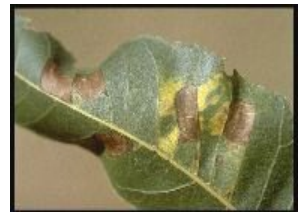
Black Pecan Aphid damage