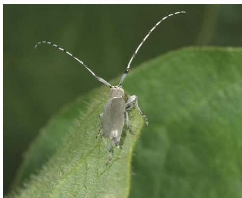
ABOVE: Adult Dectes stem borer is gray colored long horn beetle. Adults are 3/8 inch long and long antennae with dark bands around the antennae.

Dectes stem borer is a soybean stem boring insect pest that can cause severe lodging and yield reduction.