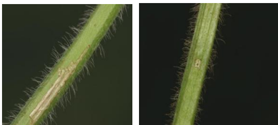
LEFT: Adult Dectes stem borer feeding scars on soybean stem.

Once thresholds have been reached the timing of a Hero® EC application can begin. Research has shown the ideal time to treat for stem borer is approximately 21 days after first emergence of stem borer adults. This timing allows for maximum adult emergence to occur, but before peak egg-laying occurs. Hero at 4-5 oz/A rate has been shown to provide excellent control of Dectes stem borers and protect soybean yields. The residual properties of Hero insecticide provide lasting control of stem borer as well as other insects including grasshoppers, podworms, stinkbugs, bean leaf beetle, soybean aphids, webworms and other pests.