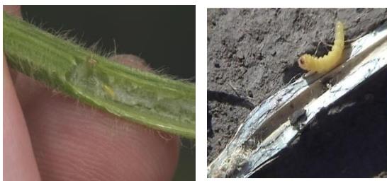
LEFT: Early instar Dectes stem borer inside of soybean stem.