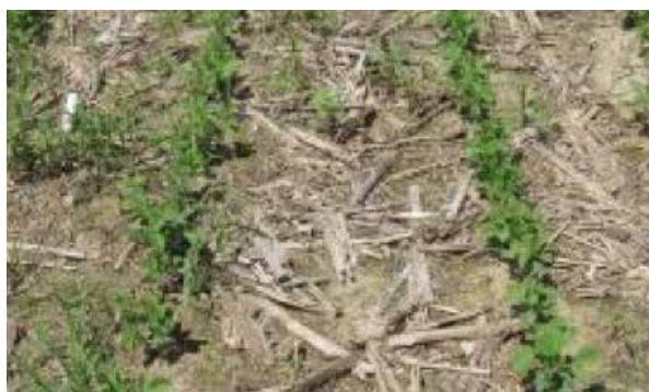
Zidua® PRO herbicide 6 oz. + glyphosate 22 oz. + dicamba 0.5 oz./A ae 56 DAT