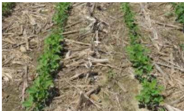
Authority® Supreme herbicide 8 oz. + glyphosate 22 oz. + dicamba 0.5 lb. ae 56 DAT