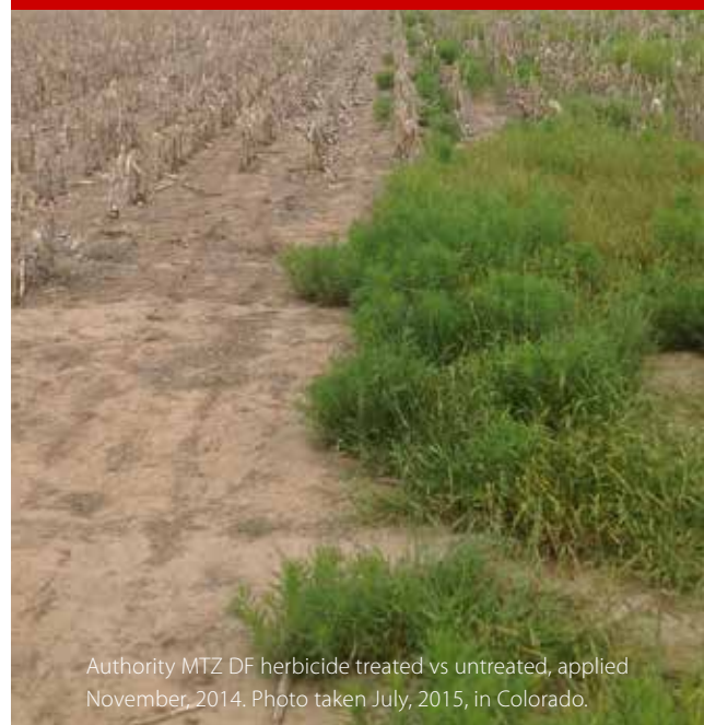
Authority MTZ DF herbicide treated vs untreated, applied November, 2014. Photo taken July, 2015, in Colorado.

With dual modes of action, Authority MTZ DF herbicide makes an excellent resistance management tool to help fields start clean and stay clean. So, burn down winter annuals and get a head start on your summer annuals with Authority MTZ DF herbicide.