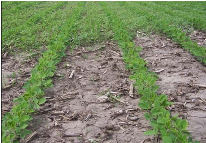
Authority Assist, foreground, untreated check, background