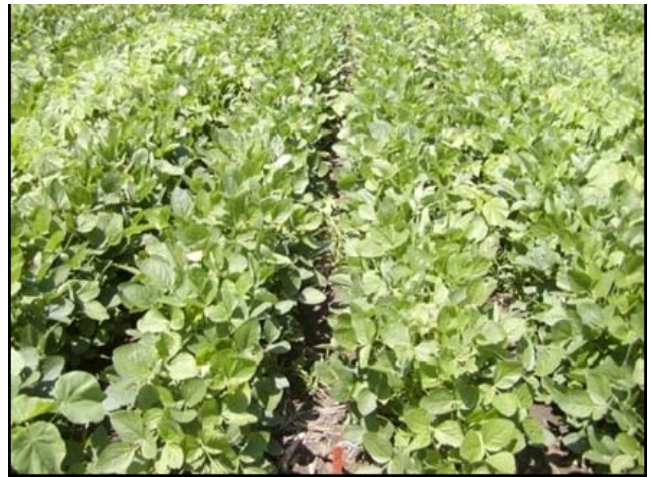
Authority Assist 45 days after planting and before glyphosate application, center, untreated area outside rows at top of photo