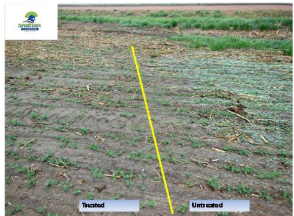
Spartan ® Charge herbicide vs. UTC on Kochia. Colorado - 2015