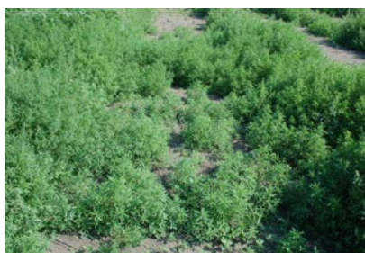
Glyphosate 22 oz. + AMS 30 days after application