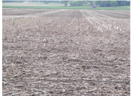
Authority ® First DF herbicide 5 oz. + Aim ® EC herbicide 0.75 oz. + 2,4-D LV6 12 oz./A: Applied 4/6, Photo on 5/8/15