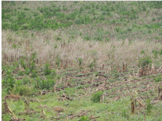
No Preplant Program