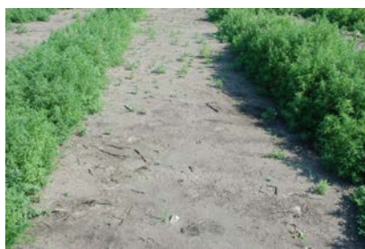
Glyphosate 22 oz. + Aim ® EC herbicide 1.0 oz. + 1% MSO v/v + AMS 30 days after application

1 oz. Aim ® EC Herbicide + 7 oz. Authority ® Assist herbicide + 1%v/v MSO + 3 2oz. glyphosate + AMS