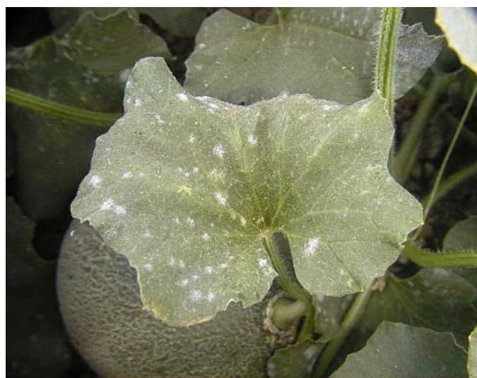
Powdery Mildew – Cantaloupe